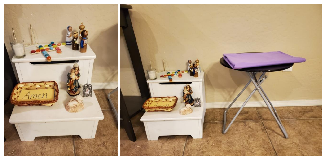
a basket or shelf to hold prayer articles.

It is a good idea to have a small basket so that your child can readily select the appropriate article and art images for the prayer table.