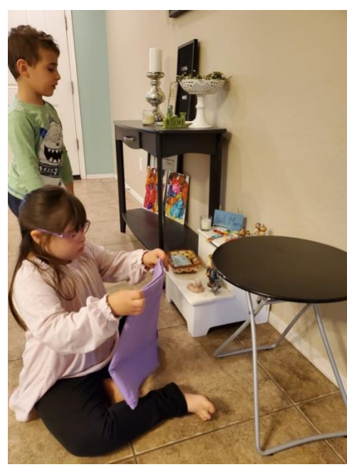
setting up the prayer table