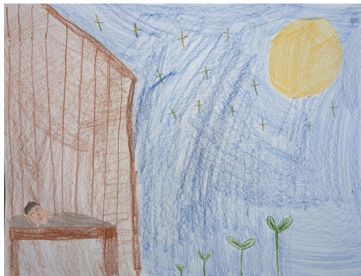
Hannah, Age 11

To select your contribution frequency and amount click HERE or visit https://www.cgsusa.org/connect/cgsusa/growing-seeds/ to complete the online giving form. For a minimum gift amount of $15 per month ($180 per year), you will automatically be recognized as a CGSUSA Growing Seeds donor, giving you one year of access to the recordings from Between Memory and Hope: 40th Anniversary Celebration as our way of thanking you for your generosity.