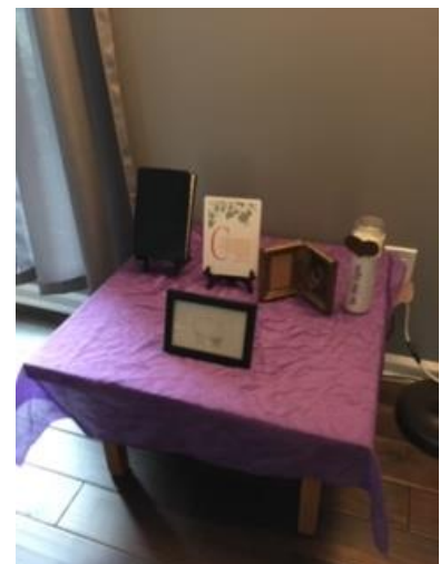
Enthronement of the Bible: (above) preparing for the Enthronement, (middle) carrying the Bible in procession to the Prayer Table, (right) the Bible is placed on the Prayer Table