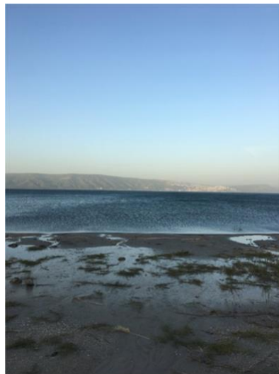
The Sea of Galilee (Matthew 4:12-22) (Mark 4:35-41) (John 21:1-14)