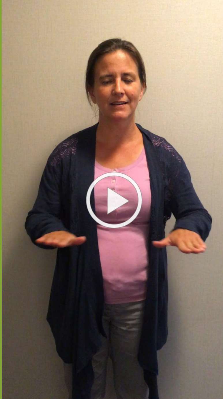
Be Still And Know